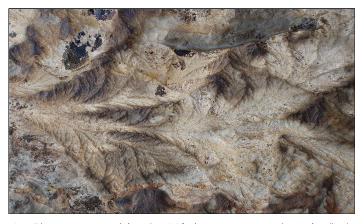
Late Ediacaran Rangeomorph from the MUN Surface, Bonavista Peninsula, Newfoundland

Note that Trips 3 and 4 will include a joint first day on the Avalon Peninsula, before diverging to their respective main sites.