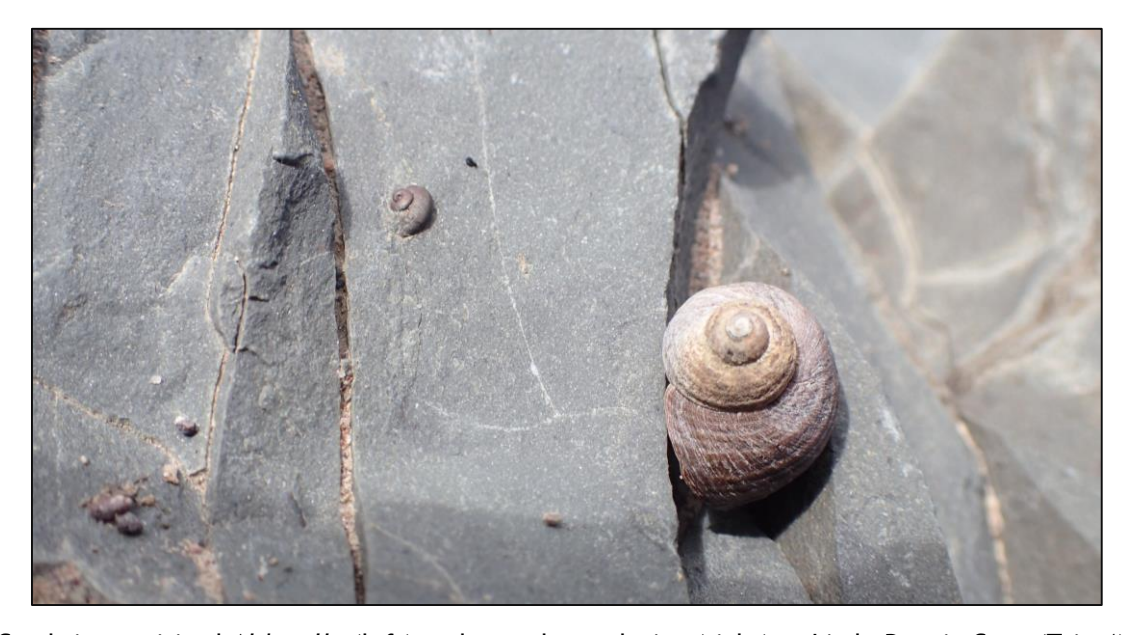
Cambrian pyritised Aldanella (left) and a modern relative (right) at Little Danzig Cove (Trip 4).

Completing a form does not guarantee a place on a particular trip, but it will enable the organisers to cater appropriately for the demand for each excursion.