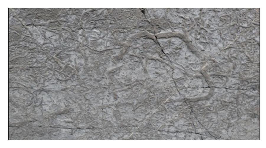
Trace fossils within Member 2 of the Chapel Island Formation at Grand Bank.