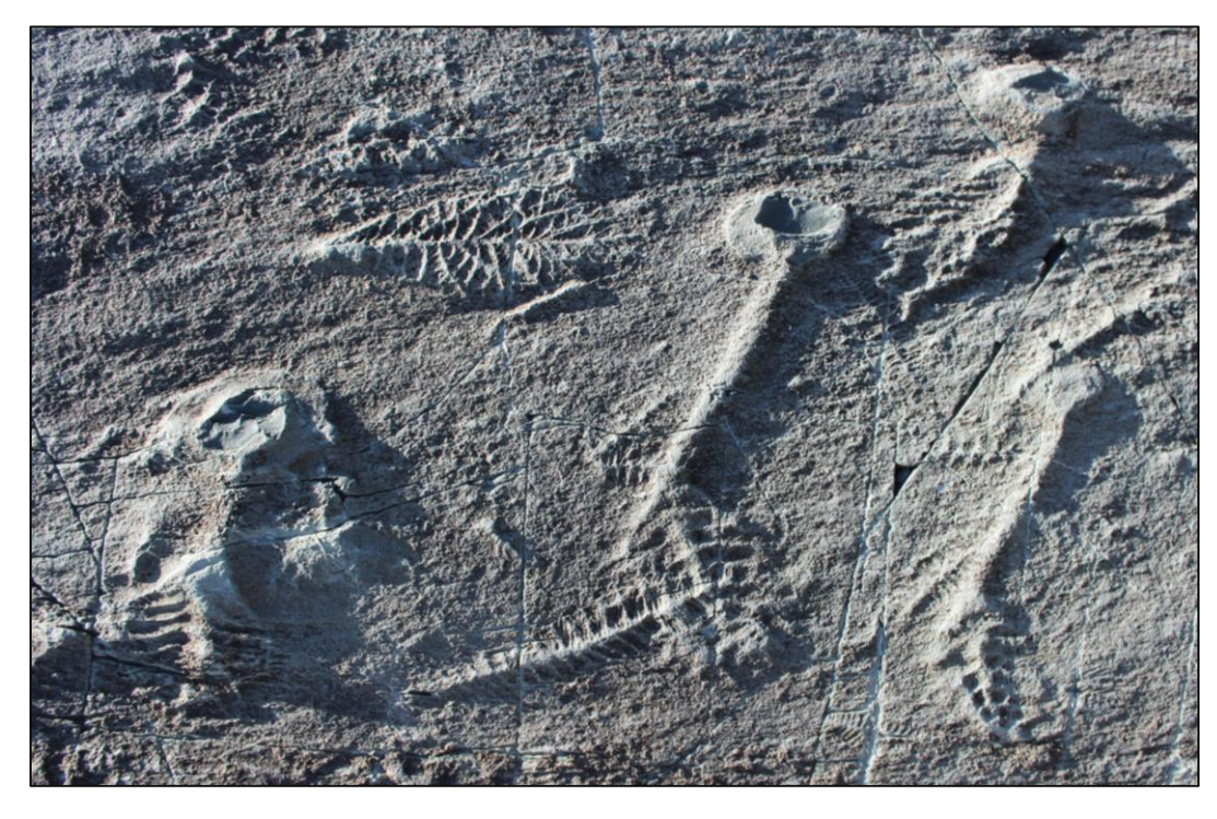
Ediacaran macrofossils on the 'E' Surface, Mistaken Point Ecological Reserve.

*Late Ediacaran fluvial deposits of the Signal Hill Group at either Cape Spear or Signal Hill.