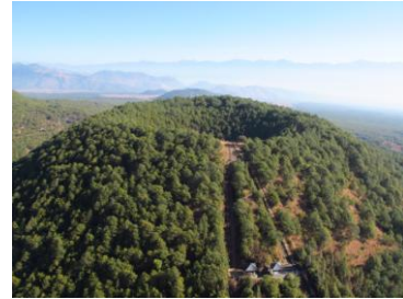
The volcanic crater in Tengchong

Day 3 (Aug. 18): Morning: Investigate the Ordovician sequence at Haidong section (paleogeographically the northern extension of the Indo-China paleoplate), and collect fossils of late Dapingian to Darriwilian age within the Xiangyang Formation at three academic stops, including brachiopods, trilobites, bivalves, graptolites, bryozoans, etc.