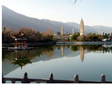
The Chongsheng Temple in Dali