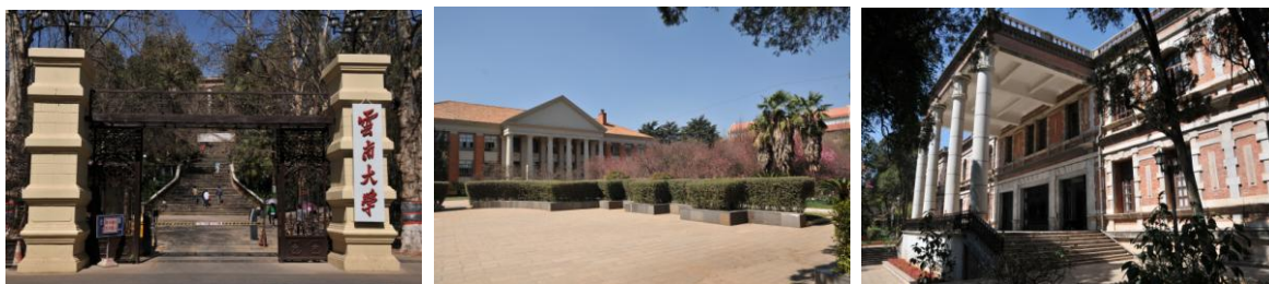
Yunnan University (conference venue) and its main buildings on campus.