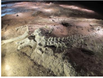
The dinosaur valley in Lufeng