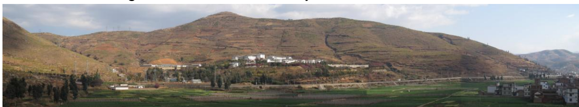
The Ordovician section at Haidong, Dali, western Yunnan

Day 2 (Aug. 17): Qüjing to Dali, western Yunnan (about 450 km, freeway). On the way, all delegates will be invited to visit the extensive Mesozoic red deposits of terrestrial facies, and the famous 'Dinosaur Valley' where over a hundred skeletons of the Middle Jurassic Lufengosaurus in association with some other prosauropoda dinosaurs were buried and are being exhibited in situ . Overnight in the Dali Ancient City.