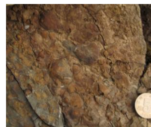
Fossiliferous bed at Laojianshan