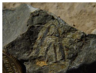
Graptolites from the Shihtien Fm