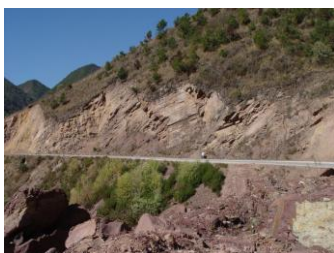
The Laojianshan Fm in Baoshan

Day 7 (Aug 22): Delegates depart for their own destinations.